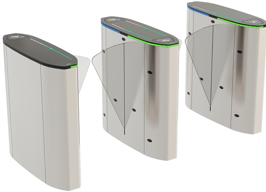
HG 02 GL-S : SINGLE UNIT (LEFT or RIGHT)